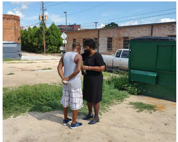
Thursday Walk in the Word at Loaves and Fishes.

Special Thanks to all who have donated their time, resources, and talents to ensure the Lord's work is accomplished through this ministry.